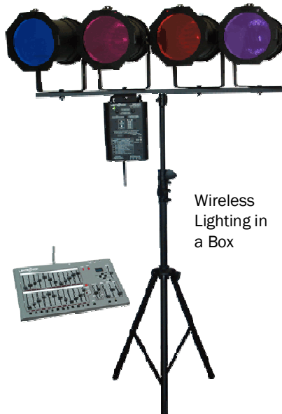
Wireless Lighting in a Box

Call the BMG Sales office for more information and pricing.