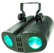
J-Five fixture and effects

DJs now have an opportunity to go green with Chauvet's LED based DJ offerings. At LDI2006, Chauvet showed the VUE family of lights. These were designed and targeted at the DJ market. They were the first DJ lights that Chauvet offered using LED technology. The VUE I, II, and III are being used around the country to produce amazing effects without a lot of programming.